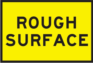
Rough Surface (900 x 600mm) - Boxed Edge Sign