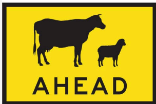
Stock Ahead (900 x 600mm) - Boxed Edge Sign