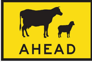
Stock Ahead (900 x 600mm) - Boxed Edge Sign