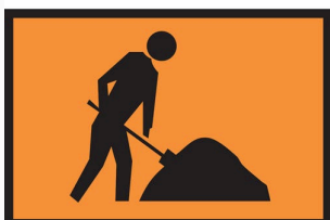
1200 x 900mm Workers Ahead - Boxed Edge Sign