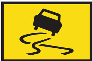
Slippery (900 x 600mm) - Boxed Edge Sign