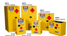
Justrite™ Flammable Liquid Storage Cabinets

External Size: 1000mm x 800mm x 1500mm Internal Size: 800mm x 600mm x 1300mm