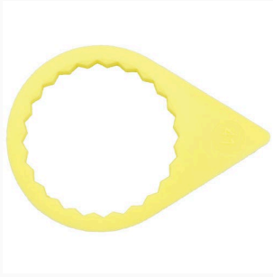
33mm Vehicle Wheel Nut Indicators (Pack of 100)