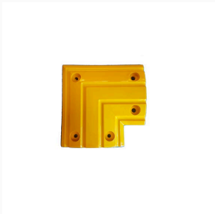
Corner 150(W) x 25(H)mm Bulldog™ Heavy Duty Bunding