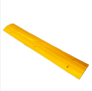
Body 1000(L) x 150(W) x 25(H)mm Bulldog™ Heavy Duty Bunding