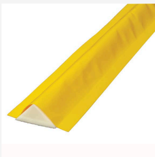
Body 2000(L) x 110(W) x 50(H)mm Tri-Bund Flexible Bunding