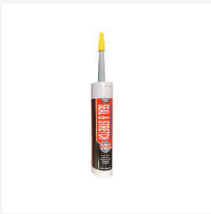
Floor Adhesive Polyurethane 310gm Tri-Bund Flexible Bunding