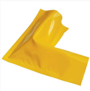
90° Joiner Tri-Bund Flexible Bunding