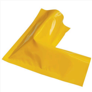
90° Joiner Tri-Bund Flexible Bunding