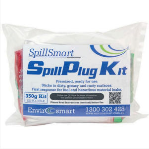
350g SpillSmart SpillPlug Kit