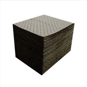
200gsm (Pack of 200) General Purpose Absorbent Poly Pads