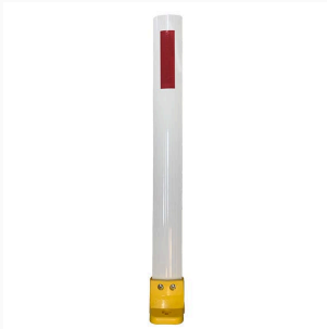
Red 50 x 200mm Delineator (Front Only) - Steel-Flex® Guide Post Surface Mount 1m