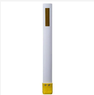
Amber 50 x 200mm Delineator (Front Only) - Steel-Flex® Guide Post Surface Mount 1m