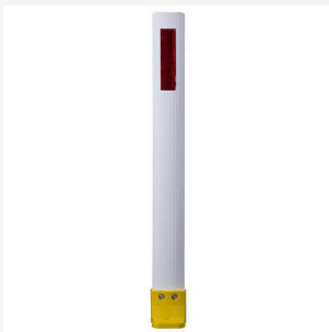
Red/White 50 x 200mm Delineator - Steel-Flex® Guide Post Surface Mount 1m