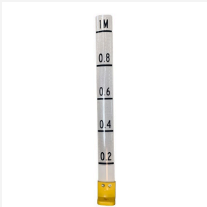
0.2-1m Flood Depth Indicator 1m Post Steel Flex (Double Sided)