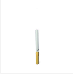
600mm Socket Mount - Poly Flex Sign Post