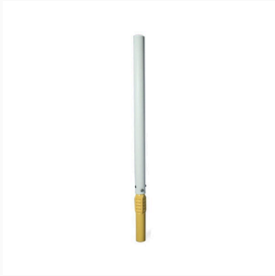
1200mm Socket Mount - Poly Flex Sign Post