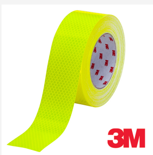
3M™ Conspicuity Vehicle Marking Tapes Fluoro Yellow 50mm x 45.7m