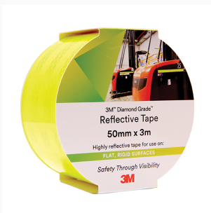
3M™ Conspicuity Vehicle Marking Tapes Fluoro Yellow 50mm x 3m