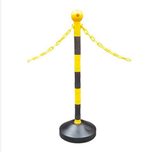
Yellow/Black Guideline Post (with water filled base)