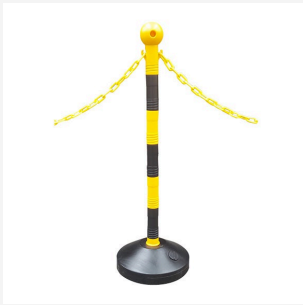
Yellow/Black Guideline Post (with water filled base)