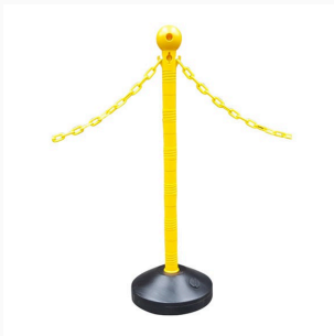
Yellow Guideline Post (with water filled base)