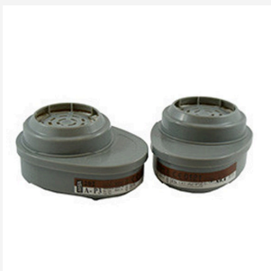
Twin Pack (suits A2 Gas/Organic Vapour & P3 Gas/Low-Profile P100)