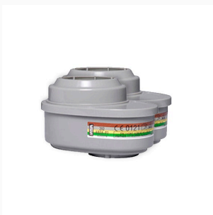
Twin Pack (suits A2, B2, E1, K1, P3 - Organic Vapour/Acid Gas/Ammonia/Particulate)