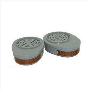
Twin Pack (suits A2 Gas/Organic Vapour)