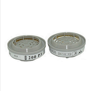
Twin Pack (suits P3 Gas/Low-Profile P100)