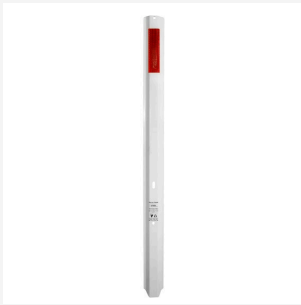
White Steel Post with 200mm Red/White Class 1A (10K Delineator)