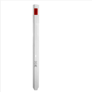
White Steel Post with 100mm Red/White Class 1A (5K Delineator)