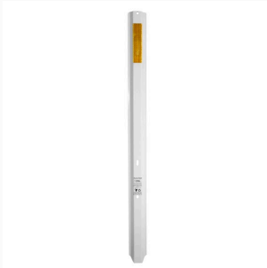
White Steel Post with 200mm Amber Class 1A (10K Delineator)