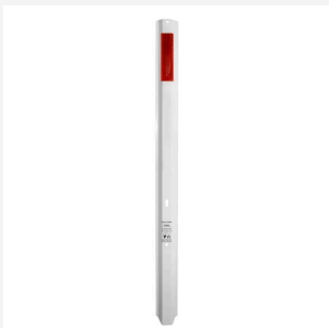
White Steel Post with 200mm Red/White Class 1A (10K Delineator)