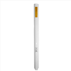
White Steel Post with 200mm Amber Class 1A (10K Delineator)