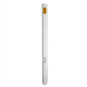
White Steel Post with 100mm Amber Class 1A (5K Delineator)