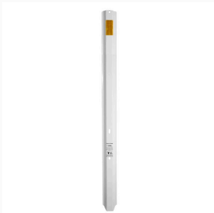
White Steel Post with 100mm Amber Class 1A (5K Delineator)