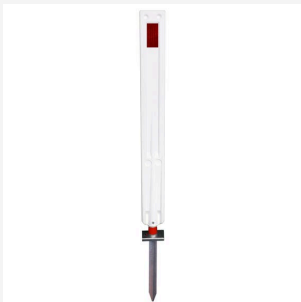
100mm Red/White Delineator - White Flexi360 Post with Anchor