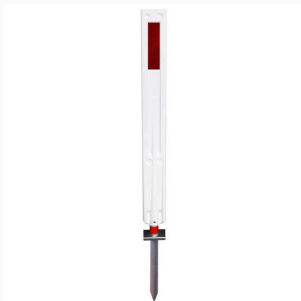
200mm Red/White Delineator - White Flexi360 Post with Anchor