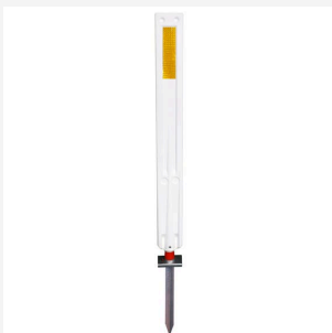
200mm Amber Delineator (Front Only) - White Flexi360 Post with Anchor