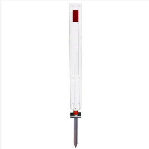
100mm Red/White Delineator - White Flexi360 Post with Anchor