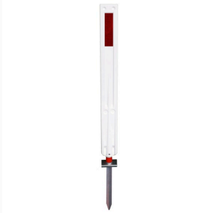
200mm Red/White Delineator - White Flexi360 Post with Anchor