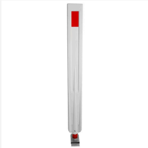
100mm Red/White Delineator - White Flexi360 Post Surface Mount