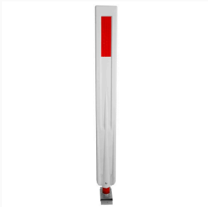
200mm Red/White Delineator - White Flexi360 Post Surface Mount