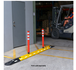
Posts sold separately