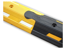
Secure interlocking design