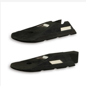
Black End Caps (Pair) - Traffic Lane Separators