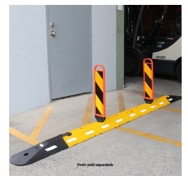
Posts sold separately