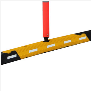
Yellow Module - Traffic Lane Separators