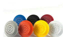
PolyStud Hazard Indicators