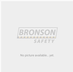
SureSteel Flat Base Tactiles Additional Adhesive (50ml)