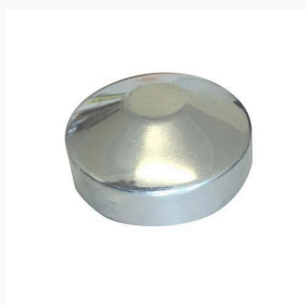
76 ODI Galvanised Post Cap