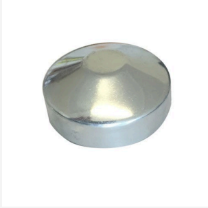
60 ODI Galvanised Post Cap