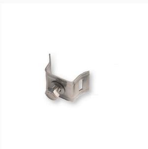
29mm Stainless Steel Banding Bracket