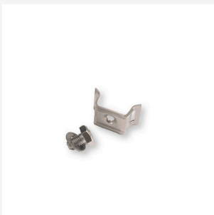
19mm Stainless Steel Banding Bracket