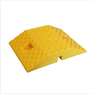
Yellow Body - Speed Hump Bulldog™