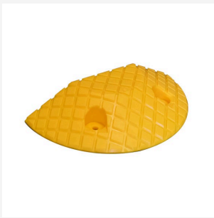
Yellow End Cap - Speed Hump Bulldog™