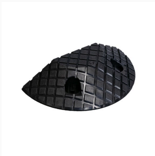
Black End Cap - Speed Hump Bulldog™