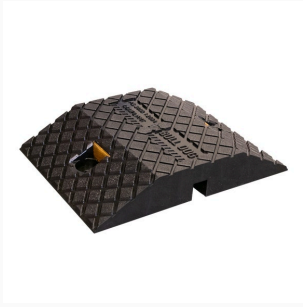
Black Body - Speed Hump Bulldog™