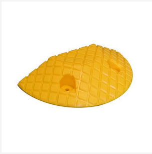
Yellow End Cap - Speed Hump Bulldog™