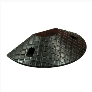
Black End Cap - Rubber Speed Hump