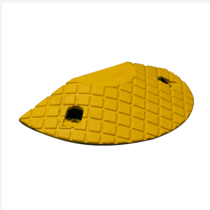
Yellow End Cap - Rubber Speed Hump