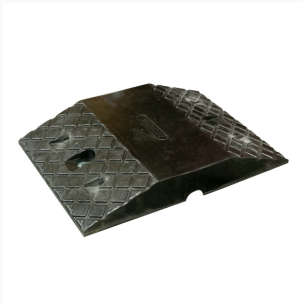
Black Body - Rubber Speed Hump