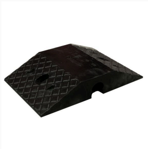
Black Body - Rubber Speed Hump (70mm)