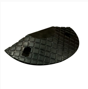
Black End Cap - Rubber Speed Hump (70mm)