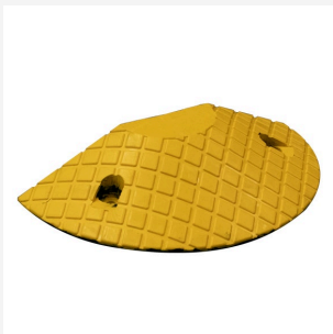
Yellow End Cap - Rubber Speed Hump (70mm)