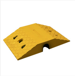
Yellow Body - Rubber Speed Hump (70mm)