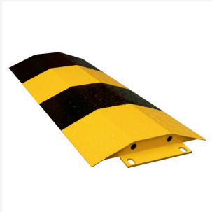
1 meter Body Section - 3mm Steel Speed Hump