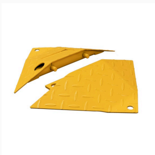
End Cap - 3mm Steel Speed Hump (Pair)