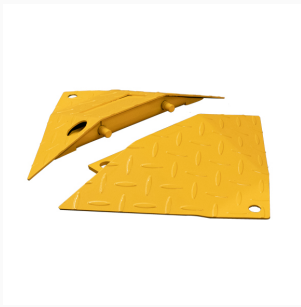
End Cap - Steel Speed Hump (Pair)