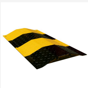
1 meter Body Section - Heavy Duty 5mm Steel Speed Hump