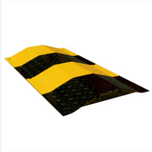
1 meter Body Section - Heavy Duty 5mm Steel Speed Hump