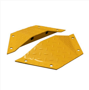
End Cap (Pair) - Heavy Duty 5mm Steel Speed Hump