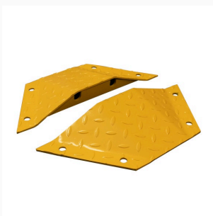
End Cap (Pair) - Heavy Duty 5mm Steel Speed Hump