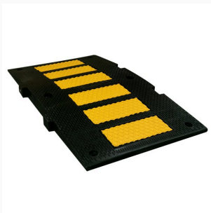
Body Section - Premium Large Modular Speed Hump