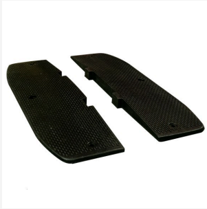
End Caps (Pair) - Premium Large Modular Speed Hump