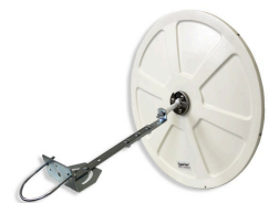
Flat mount and wall mount hardware is included. (with Mirror 100 Part)