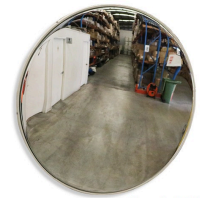
Crystal View™ SAFETY MIRRORS