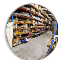
Crystal View™ SAFETY MIRRORS