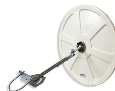
Post mount and wall mount hardware is included. (See Mirror Size Chart)