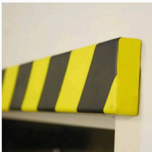
Flat "Rectangular" Profile Anti-Collision Impact Protectors