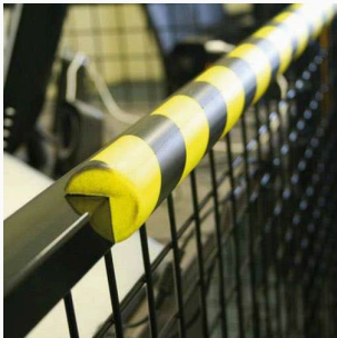
Round Corner "V" Profile Anti-Collision Impact Protectors