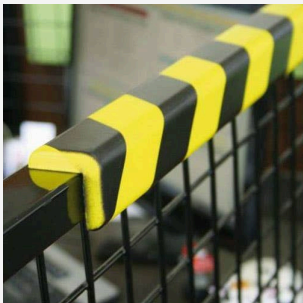
Square Corner "L" Profile Anti-Collision Impact Protectors