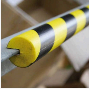
Round Edge "C" Profile Anti-Collision Impact Protectors