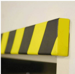
Flat "Rectangular" Profile