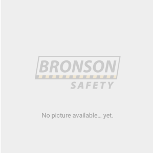
Poly - Keep Left Sign (600 x 450mm)